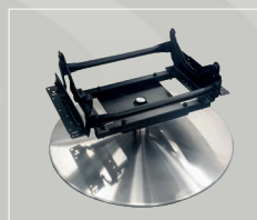
Buggle or star base